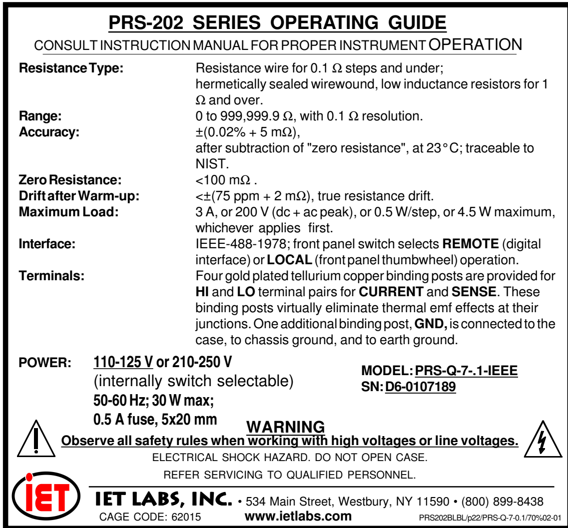
Figure 2.1 Typical OPERATING GUIDE Affixed to Unit