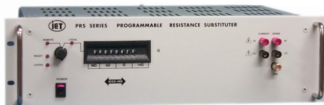
Figure 1.1: High Precision Manual or Programmable Decade Resistance Substituter

The PRS Series may be rack mounted to serve as components in measurement and control systems.